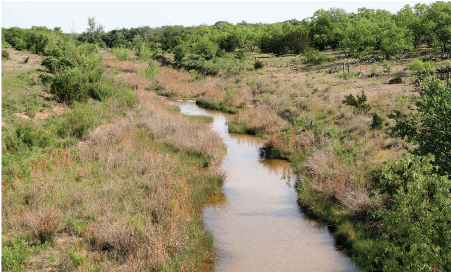
This creek in Gillespie County is fenced. This allows the owner to graze the creek pasture periodically, but not overgraze it.