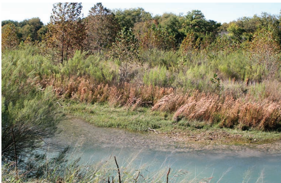
The active floodplain of a creek or river is where floodwaters spread out and where sediment is deposited.

easier than you might think. In fact, in most cases the creek will tend to fix itself through natural recovery if it is given a chance to heal. In most cases, if the landowner ensures the normal growth of good, dense, native riparian vegetation, the creek area will begin to stabilize. As the velocity of floodwater is slowed, additional new sediment is deposited, forming new banks and rebuilding the floodplain. Creek and riparian areas usually respond quickly to improved vegetation and improved management. However if poor management continues, the creek will never recover and will get even worse.