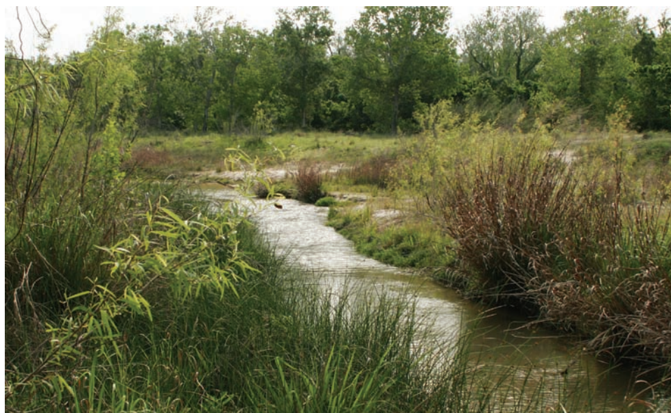
This small creek in South Texas has healed up on its own after several years of good management.

advantage of the abundant and high quality forage. This is sometimes called “flash grazing,” where the whole herd is allowed to graze for a short time followed by a long rest and recovery period.