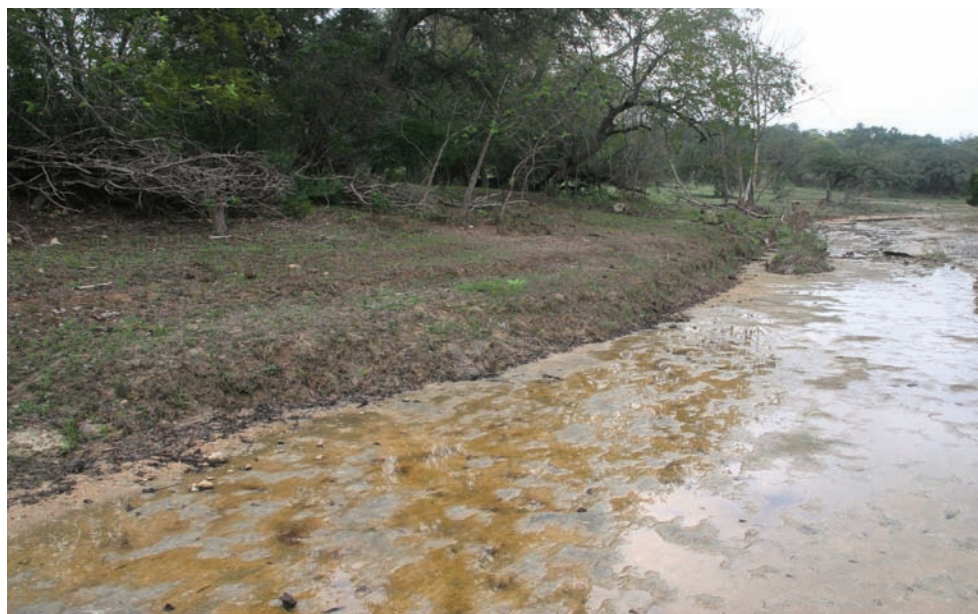
Continuous unmanaged livestock grazing in the creek area often results in overgrazing of important stabilizing vegetation.