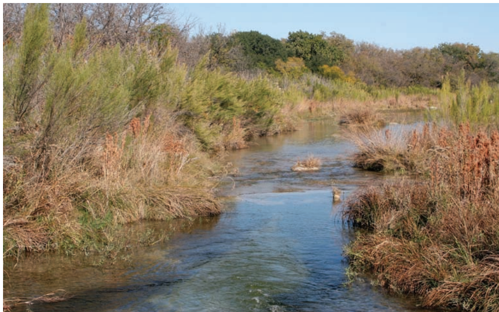
One important attribute of a healthy creek is an abundance of strong stabilizing riparian vegetation.