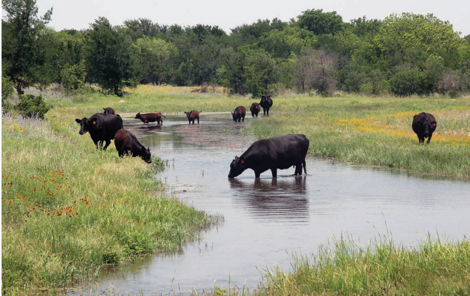
Livestock grazing can be compatible with good riparian condition when done properly. Short graze periods followed by long recovery periods are the key to maintaining good vegetation.