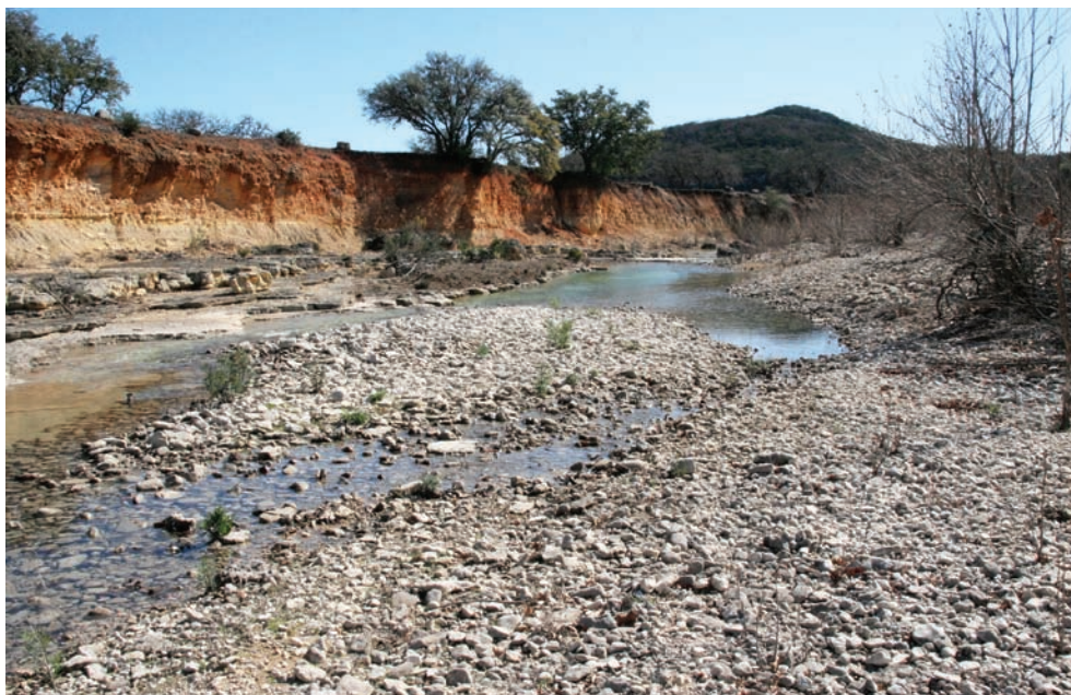
This creek has been severely damaged by high number of exotic deer and unregulated grazing.