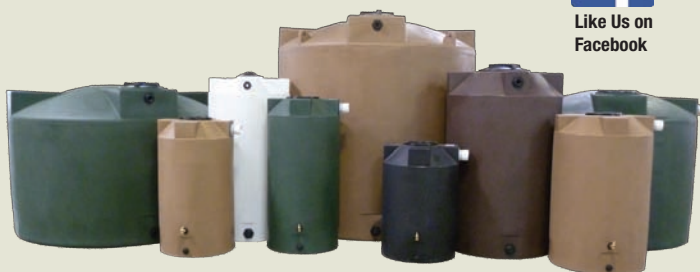
Poly Storage Tanks