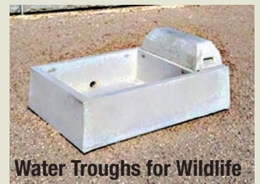
Water Troughs for Wildlife